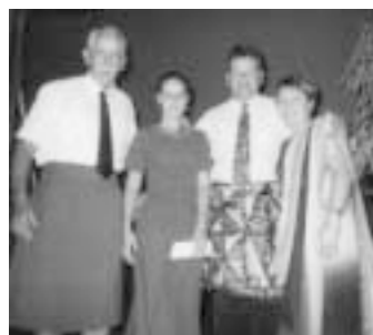
Rebound South Pacific GSE Team