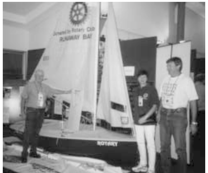
"Sailability" - Display.