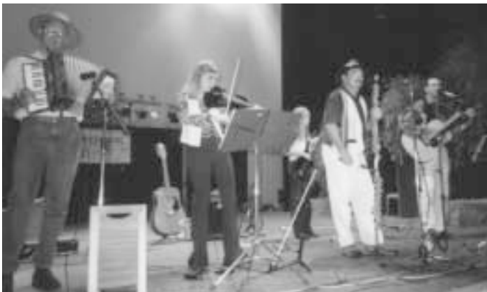
Bush Band Bando'Coos