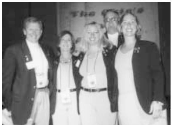
Oklahoma GSE Team