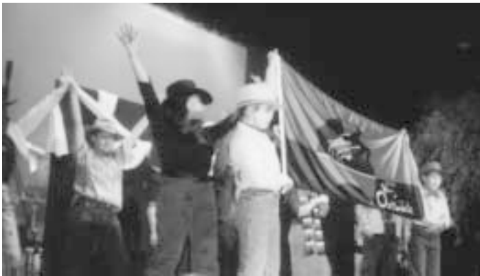
"Fashion Parade" - Finale