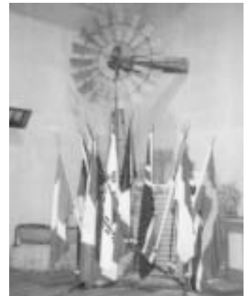
Flags & Windmill