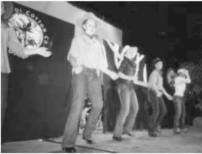
"Fashion Parade" - Entertainment