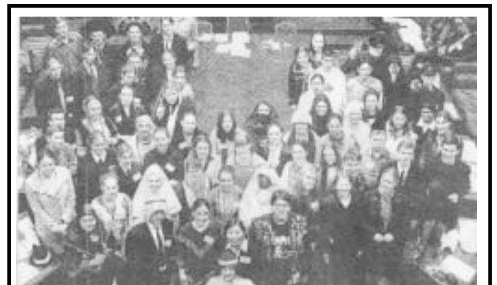
A group of Australian students at Old Parliament House Canberra at the National MUNA held on 25th & 26th August