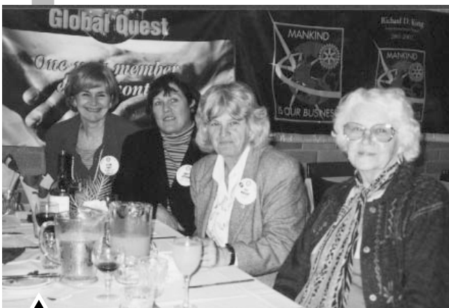
Kingscliff & Warwick Rotarians