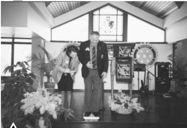
Start of year weigh in