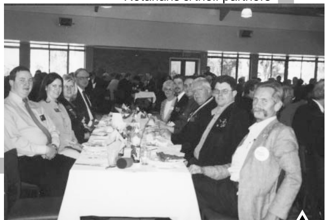
Happy group of Rotarians & Rotaractors