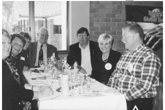
Surfers Central & Ashmore Rotarians & their partners