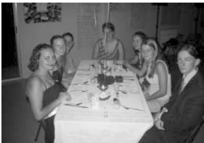
A table at RYTS Graduation

Here are some photographs taken at the seminar.