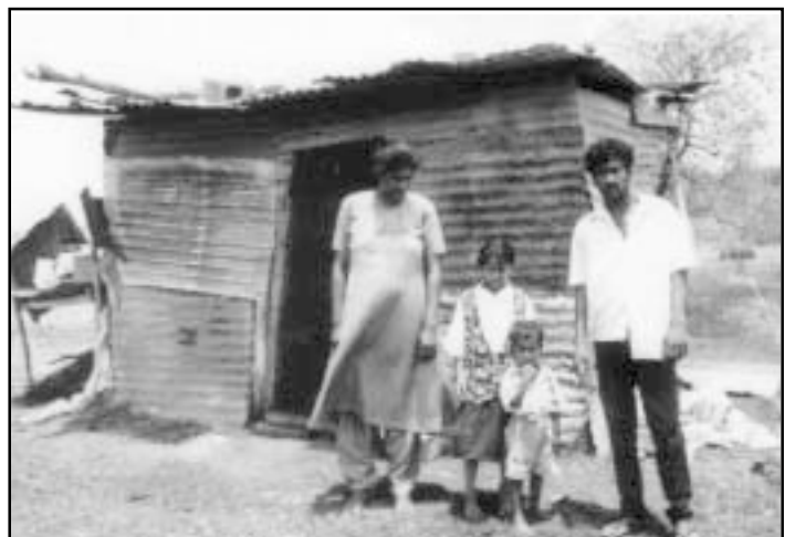
Squatters shack deathtrap in cyclone.