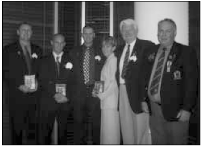
GSE Brazil Broadbeach