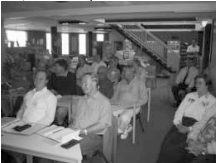
ARHRF Seminar participants

She clearly demonstrated the value of ARHRF grants to enable research to be conducted into this rather disturbing question with a potential for making a difference.