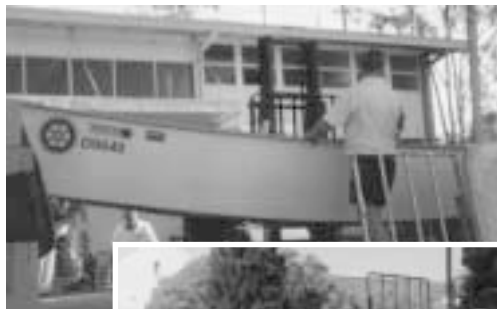
Loading NQX truck bound for Darwin

This is a wonderful example of the ongoing partnering with various organisations who respect Rotarians for their ability to provide meaningful service to people less fortunate than themselves.