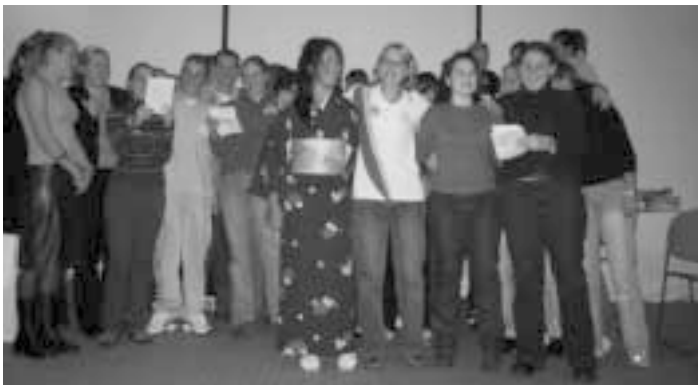
The Exchangee Song being led by ROTEX members at the YEP Briefing Camp for Outbounders held on the 28/29th July.

The Briefing Camp for our Outbounders was held for the first time at Byron Bay Beach Club. 26 Outbounders and their families enjoyed a weekend of fun, fellowship and instruction