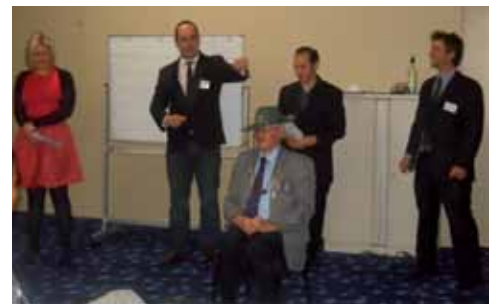
• All part of selecting a GSE Team

A reminder to everyone that our District Conference is at Jupiters here at Broadbeach on the weekend of April 13-15 next year. Our theme is BUILDING FAMILIES/MAKING WAVES. We have programs for young people and we are all going to Outback Spectacular on Saturday night so we encourage families to come. If there are Gold Coast Clubs who would like to home host people from our country clubs, I'd like to hear from you. This would make the conference more affordable, encourage more to come and build friendships within our Rotary family.