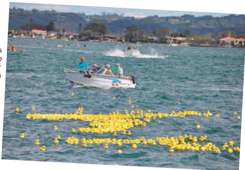
• Rotary of Ballina's successful Annual Duck Race.

The Rotary Club of Lismore West has inducted two new members into the club this year. The club's GSE nomination of