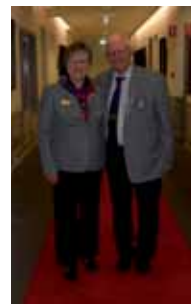
• How do you top a red carpet welcome