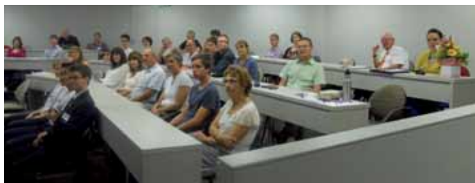
• NYSF Orientation Day

Rotary reaches the length and breadth of the country, and as such is ideally placed to screen all candidates who apply. Not only is the forum looking for students with a love of science, but also students who can make the most of the opportunity to develop other skills such as communication, leadership and working collaboratively together.