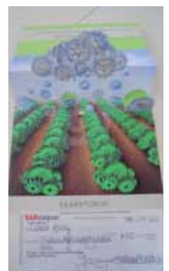
• Learn Grow card from Coomera River

A reminder to everyone that our District Conference is at Jupiters here at Broadbeach on the weekend of April 13-15 next year. Our theme is BUILDING FAMILIES/MAKING WAVES. We have programs for young people and we are all going to Outback Spectacular on Saturday night so we encourage families to come. If there are Gold Coast Clubs who would like to home host people from our country clubs, I'd like to hear from you. This would make the conference more affordable, encourage more to come and build friendships within our Rotary family.