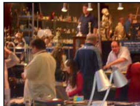
• Antiques with Palm Beach