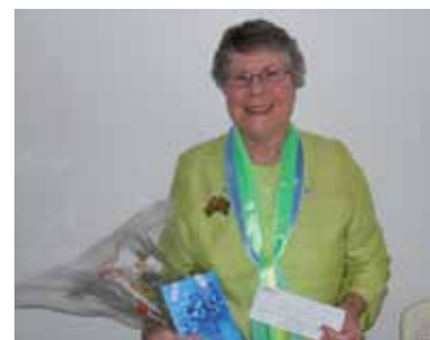
• A bouquet for Learn Grow

If you would like to know more, go to learngrow.org