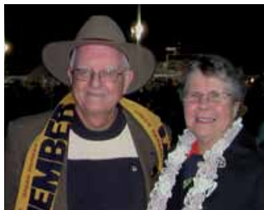
• Rugged up at Bulls on Beach

Forum at Bond University, the mid-year Antique Fair (Palm Beach), Bulls on the Beach in Sea World carpark (Gold Coast), and Opera at The Channon (Lismore and Lismore Central). To add a special historical touch we enjoyed the rainforest walk in Rotary Park that was created and maintained by the Rotary Club of Lismore from 1950 to 1965. That must have involved a huge amount of work before it was taken over by local government.