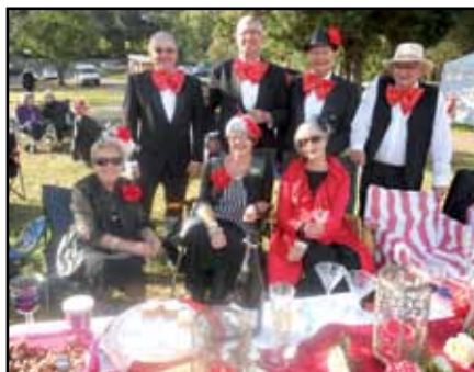
• Colourful Alstonville at the Opera