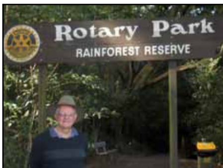
• Nostalgia in the Rainforest

A special thanks to clubs for their donations to the "Horn of Africa" via Disaster Aid Australia. The appeal has reached $15,000.